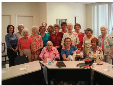
The Esther and Martha Circles of Peace Memorial's Presbyterian Women, represent many generations of faithful service to Christ.